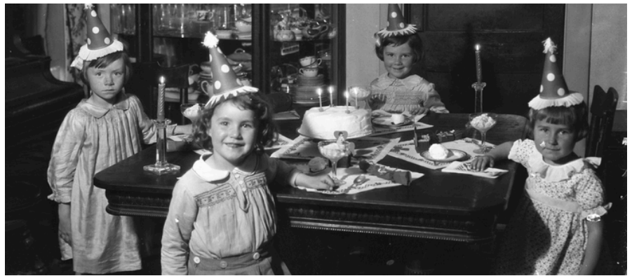
Wayne County Public Library Local History Collection